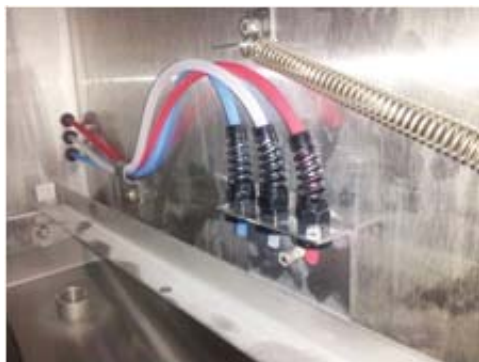
Showing chemical lines above sump

ADS provides three (3) peristaltic pumps to dispense liquid chemicals Chemical feed lines are color coded "Red" Detergent, "Green" Sanitizer, "Blue" Rinse-aid Pick-up tubes are provided for chemical product containers Sanitizer (chlorine) concentrations should be set at 50 parts per million Inspect the transfer tubing for any cuts or holes, keep them protected and secured out of the way