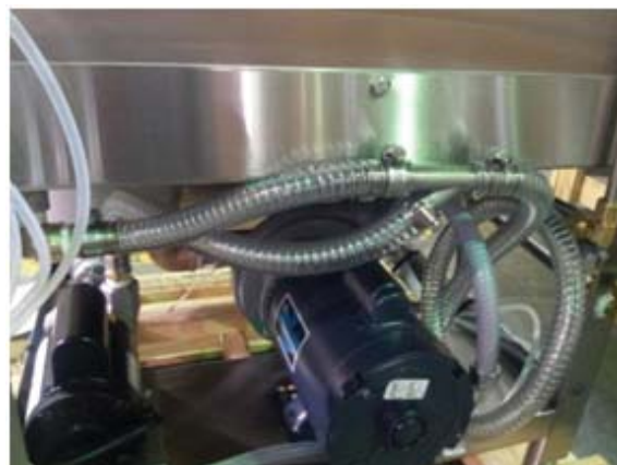
Drain “y” from overflow & drain pump, 48” drain tube