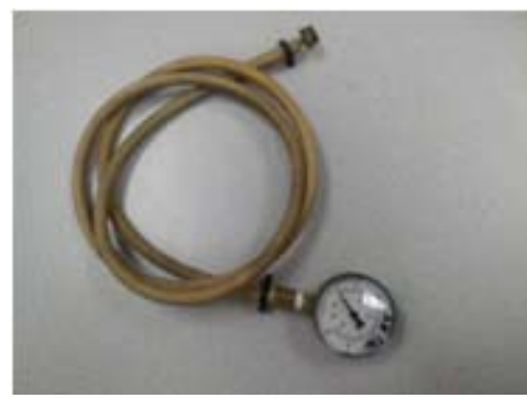
Spray arm pressure tester # 088-1048