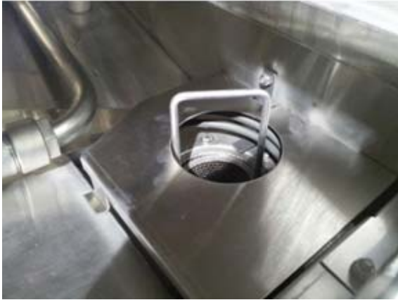
Sustainer heater cover and pump filter system

7 AFTER FLUSHING—install the spray arm. Failure to follow this flush procedure can damage the spray arm bearing. Observe the water level decal. This decal is located on the outside of the pan next to the sump. This mark is the approximate level for initial fill. Verify incoming water temperatures 120°F minimum (130-140°F recommended).