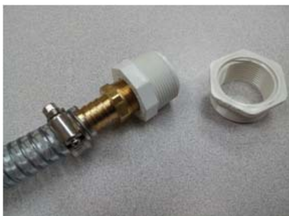
Recommended drain tube connection to building drain