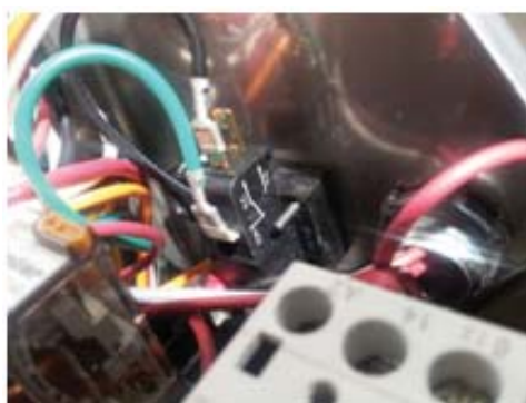
Optional Chemical Alarm switch