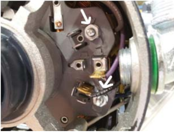
1.5 HP Motor, arrow 1 arrow 2 point to L1 & Neutral connect points