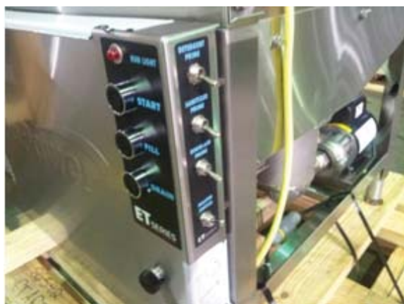
Showing controls on lower access door & drain pump

A time cycle of 90-seconds is the shortest time available for this model and is compliant with NSF listing. To change to a longer time cycle, the entire cam timer assembly must be changed because of the motor gearing.