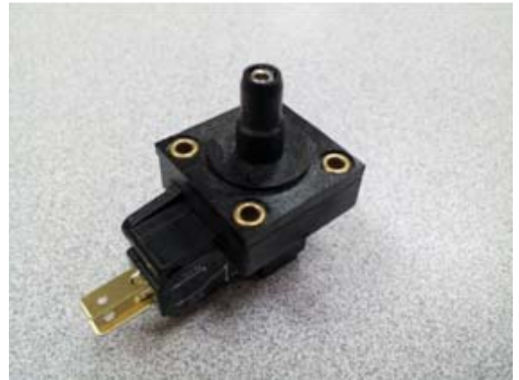
Optional chemical alarm pressure switch

IT IS RECOMMENDED THAT THIS EQUIPMENT BE INSTALLED USING A NEW CIRCUIT BREAKER.