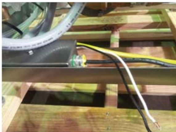
Power junction box for incoming 120v power