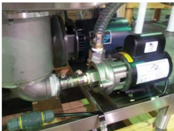
Showing stainless drain pump w/3/4” discharge tube

To the rear of the machine is found the drain “Y” for the tube coming from the drain pump and the tank overflow. Do not remove the Y from the back. When the drain line is run down from 20” off the floor, the Y affords protection from overflow and leaking water solenoid conditions.