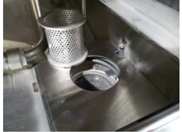
Secondary basket for dumping, primary filter shown in place

8 PUMP FILTERS—Inspect the sump area and verify pump filters are in place. The primary filter is bolted in place and should not be removed by the end-users. If the secondary filter basket is used properly, this will avoid unnecessary cleaning of the primary filter (which should only be cleaned by qualified personnel). The secondary filter basket is used to block the path for picks and straw's through the primary filter holes; it catches and holds solids. The secondary (loop handle) should not be removed before draining the machine. It should be removed and emptied only after the machine is completely drained—like the tray of a scrap box. Verify that chemical feed lines are in their proper container and that lines are primed. Post an operational wall chart close to the machine.