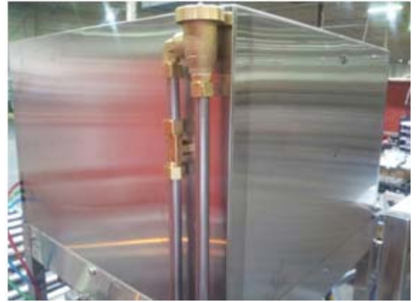
ASSE approved vacuum breaker (backflow preventer)