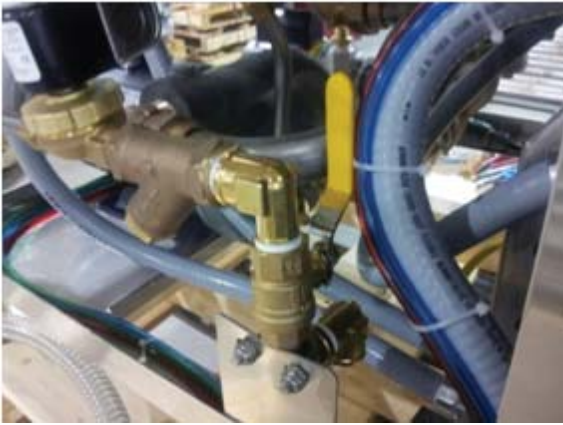
Showing 1/2" female pipe inlet, ball valve, y-line filter, H2O solenoid