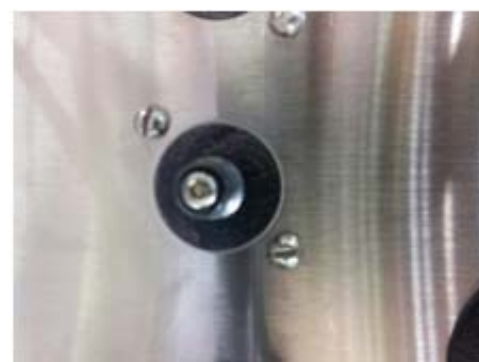
Chemical alarm barb adjusting screw *

TYPE OF CHEMICALS —Use only commercial grade low-energy chemicals. For proper operation, use non-foaming detergents and buffered sanitizer. Do not wash gold, pewter, silver, or silver-plate with chlorine based sanitizers. High concentrations of chlorine sanitizers and caustic detergents will cause damage to metals and welds. Do not exceed 50 parts-per-million (PPM) "free" or available chlorine. Any setting higher than 50 ppm will be dependent on local health requirements, however, the increased chlorine will result in higher corrosion of metal parts. The resulting damage from overusing chlorine is not covered under the ADS warranty. Purpose-built ware-washing dispensers are needed to properly meter chemicals for wash and rinse. These dispensers are included with this model. Manually adding industrial chemicals to the dishmachine is unsafe and not approved.