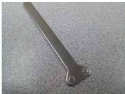
Cam adjustment tool

Timers are available with 7- or 8-cams. The cycle times are not adjustable. The cams of the timer are wheels whose positions are either fixed or adjustable. Each cam controls a specific machine function, as noted on the timer decal. Adjustable cams are comprised of two wheels held together at the hub. The perimeter of each wheel is divided into 180° of high cam and 180° of low cam. When one of these wheels is rotated on the hub in relation to the opposing wheel, the two lower cam segments can form a notch in the perimeter (see photo page 10). Above each cam is a timer switch with a metal finger that rides along the outer edge of the cam. When the finger drops into the lower cam notch, the function of that cam starts.