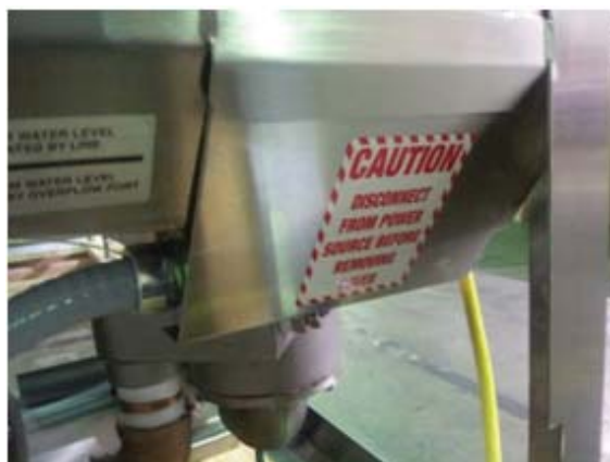
Heater terminal box in right front side of the pan