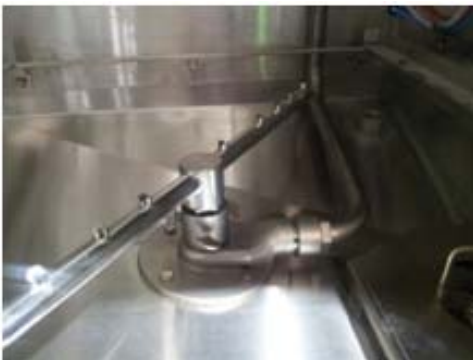
Spray arm, base w/thumb screws