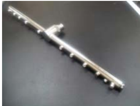
Standard ET-AF spray arm (081-6208)