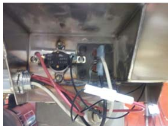
Heater box less cover, thermostat, element, float wires

THE SUSTAINER HEATER— is rated 500 Watts at 120v, and will draw approximately 4 amps. It is not designed to provide operational heat ; the operational hot water must be provided by the building's primary water heater . The sustainer heater will not provide a rise to the incoming water temperature. Its purpose is to sustain the existing hot water sitting in the pan of the machine if it were to sit idle for periods of time. The sustainer will only operate when the pump motor is off.