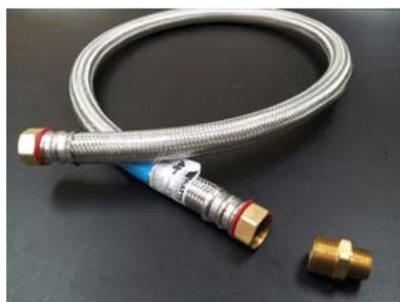
OPTIONAL 48” hot water inlet flex hose and adapter (088-1068)