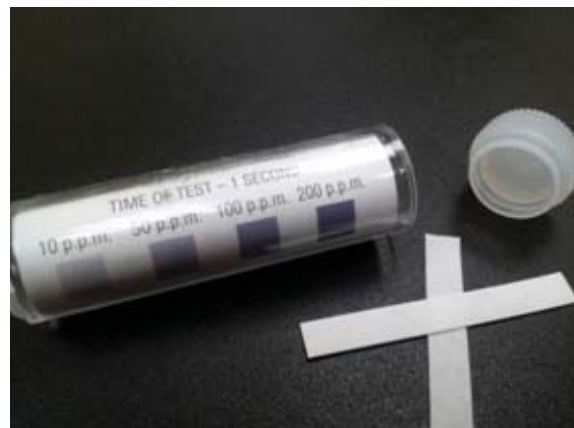
Chlorine test strips for measuring sanitizer

ADS provides three (3) peristaltic pumps to dispense liquid chemicals Chemical feed lines are color coded "Red" Detergent, "Green" Sanitizer, "Blue" Rinse-aid Pick-up tubes are provided for chemical product containers Sanitizer (chlorine) concentrations should be set at 50 parts per million Inspect the transfer tubing for any cuts or holes, keep them protected and secured out of the way