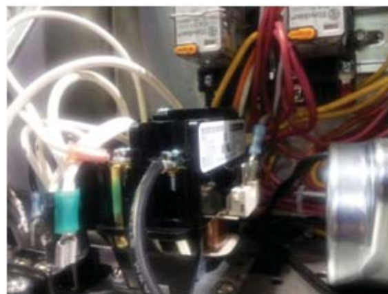
Wash motor contactor to the left of the cam timer motor