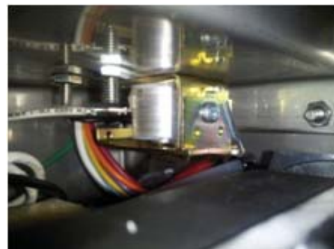
Left is Start Relay, right is Heater Relay Left is Drain Relay, right is Heater Contactor Optional buzzer for low chem. alarm