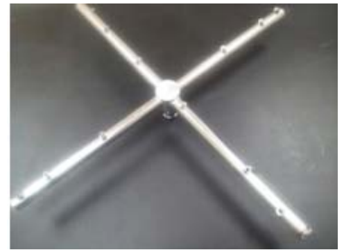
Cross arm for light glassware (081-6212)