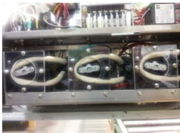
Showing detergent, rinse, sanitizer internal chemical pumps